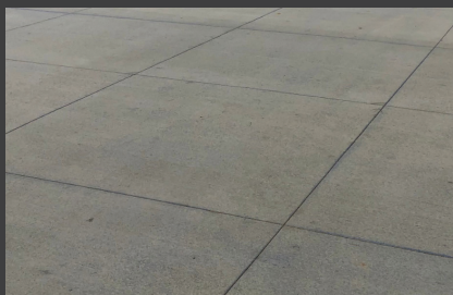
SHORT PANEL JOINT SPACING, 5-8 FT (1.5-2.4M)

5.5in/140mm Concrete Thickness with 4.0in/100mm Granular FORTA-FERRO ® 6ft/1.8m Joint Spacing